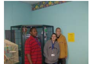
Mentees at The City Zoo Pet Store