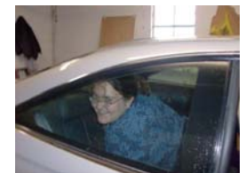
Mentees at United Detailing enjoy a variety of tasks

Disability Mentoring Day came to the nine-county Southern Tier area in 2006, when a committee of government and non-profit agency employees in the Broome and Tioga County areas decided to plan a DMD event in Binghamton. The event continues there on an annual basis. This year's Chemung County event was the first step toward expanding the number of activities across the Southern Tier in 2009, giving more individuals with disabilities the opportunity to experience a career of interest to them.