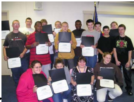
Students received certificates of participation in DMD

On Wednesday, October 22nd, 17 students from GST BOCES participated in Chemung County's first Disability Mentoring Day (DMD) event. DMD provides opportunities for individuals with disabilities to be mentored, or to job shadow in career areas of interest to them.